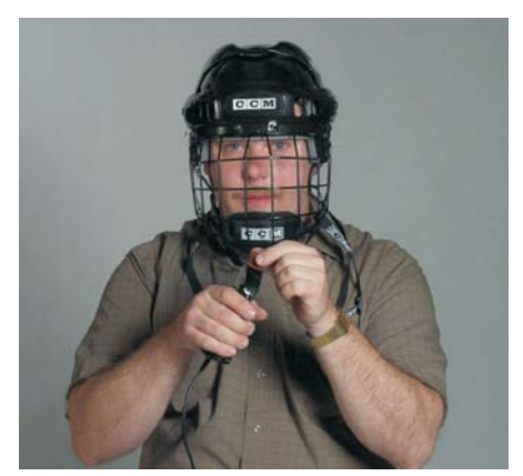
Figure 2. CCM 2001 HK 400 combo helmet.

Testing was performed with the PAT utilizing a previously described protocol.<sup>10</sup> This protocol had: settings for the PAT, verbal instructions for the subject, test distance, lighting conditions, subject's testing alignment position, recording method. Incident luminance on the PAT measured 40-70 cd/m<sup>2</sup> of illumination with a light meter.<sup>c</sup> Each subject maintained a test distance at one meter from the PAT. The PAT mode was set to "touch, eight fields of gaze" in the "test position." Testing at SCCO was completed in two days by two authors (ST, CB) and one day at the San Diego Ice Arena, Mira Mesa, California, by three authors (ST, AL, JL). We verbally gave