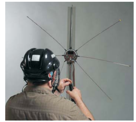
Figure 1. Wayne Peripheral Awareness Tester.

Testing was performed with the Wayne Peripheral Awareness Trainer (PAT)<sup>a</sup>.<sup>8</sup> This instrument is compact and contains an Intel micro-computer programmed to measure reaction time to a peripheral stimulus in eight fields of gaze. There are eight peripheral rods (six long and two short at the 12:00 and 6:00 position) inserted into eight holes in the instrument. The rods are displayed radially in eight fields of gaze where a single green light appears at the end of each rod. See Figure 1. The subject maintains central fixation by viewing a centrally positioned red light that turns on and off. The PAT randomly presents a peripheral green target light in one of the rods. The subject is